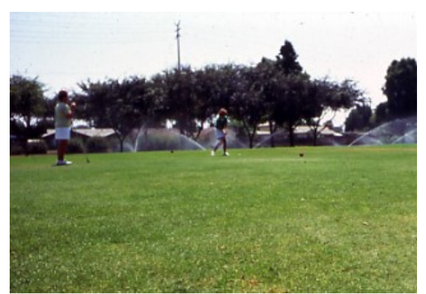
Inadvertent public contact with recycled water irrigation spray must always be avoided.