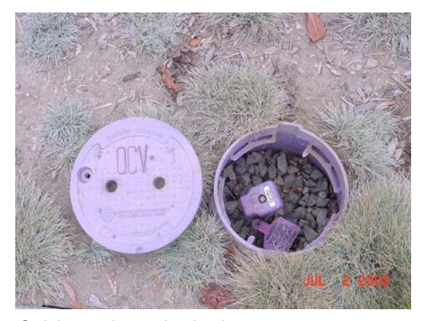
Quick coupler and valve box

New quick coupling valves, made specifically for recycled water use, should be 3/4-inch or 1-inch nominal size and of brass construction with a normal working pressure of 150 psi. The covers on all new quick coupling valves must be permanently attached and made of purple rubber or vinyl with the words "RECYCLED WATER" imprinted on the cover, and must be provided with a lock. To prevent unauthorized use, the valve should be operated only with a special coupler key with an acme thread for opening and closing the valve. New quick coupling valves should be installed approximately 12 inches from walks, curbs, headboards or paved areas. All new and existing quick coupling valves must be identified with an identification tag and installed in a marked valve box.