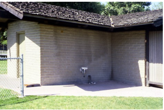
The pattern on the walls indicates that this drinking fountain is being sprayed by the irrigation water. If recycled water is to be used, then the spray pattern must be altered or the drinking fountain somehow shielded.

Drinking fountains located within the approved use area must be protected from contact with recycled water by direct application through irrigation or other approved use. Lack of protection, whether by design, construction practice or system operation, is strictly prohibited.