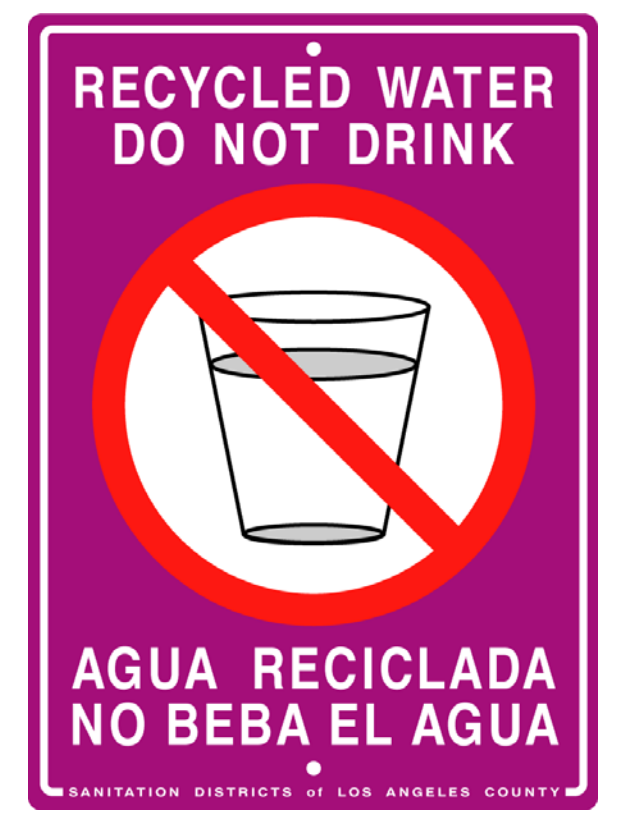
Recycled water notification signs do not need to include such words as "Caution," "Warning" or "Danger."

Posting the use of recycled water is required at all entrances to the User's facility, and placed where they can be easily seen. The signs must indicate that "RECYCLED WATER" is in use. In addition, all signs must include the "Do Not Drink" symbol (page 25) and use the words "do not drink," in both English and Spanish (or other locally used language). Additional signing may be required by the Regulatory Agency on a case-by-case basis.