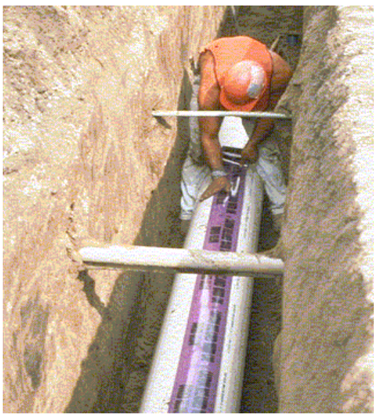
Recycled water pipeline installation with continuous purple warning tape.

All new, buried recycled water lines (pressure/non-pressure) must be extruded purple-colored Schedule 40 (minimum) PVC pipe with continuous wording "CAUTION -- RECYCLED WATER" printed on opposite sides of the pipe. The use of continuous lettering on 3-inch minimum width purple tape with 1-inch black or white contrasting lettering bearing the continuous wording "CAUTION --RECYCLED WATER" permanently affixed at 10-foot intervals atop all horizontal piping, laterals and mains is an acceptable alternative to the purple pipe. Identification tape must extend to all valve boxes and/or vaults and exposed piping.