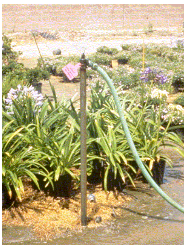
Hose bibbs may only be used with recycled water in areas were they cannot be accessed by the general public (such as this commercial nursery), and even those must be properly labeled.